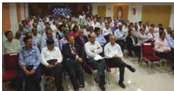
Section of members