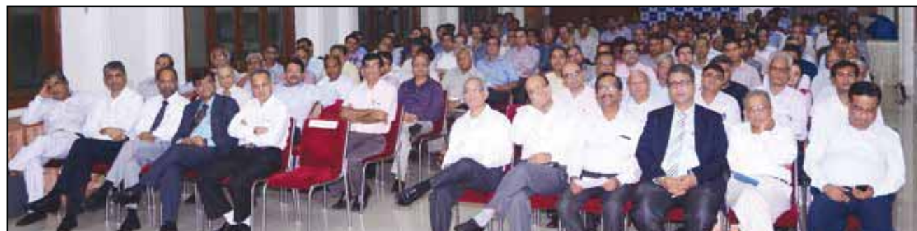
Section of members