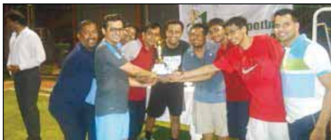
2nd Runner-up Team - CTC Team