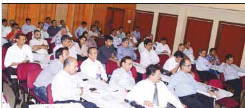
Section of delegates