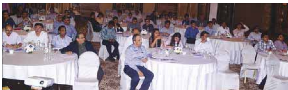
Section of delegates