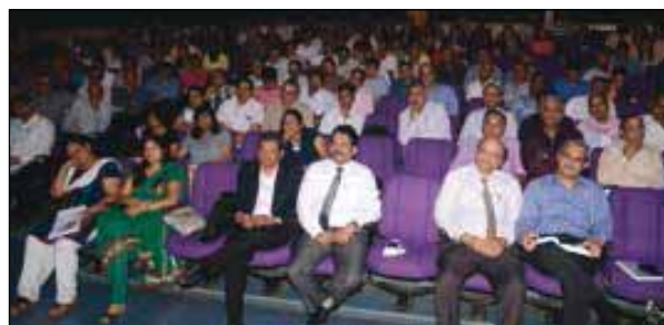
Section of delegates