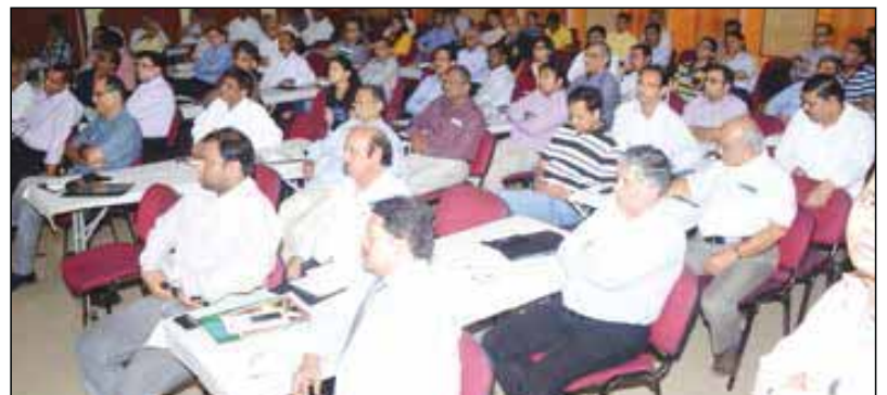
Section of delegates