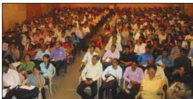
Section of Students