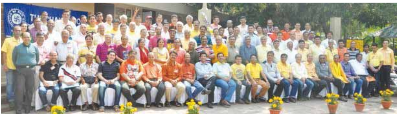
38th RRC – Group Photo