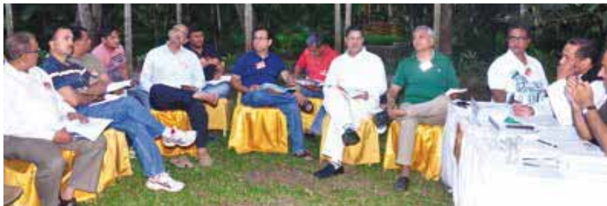
38th RRC - Group Discussion