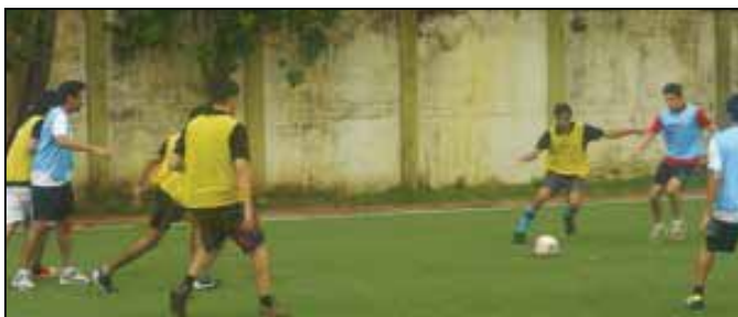
Players Playing Football