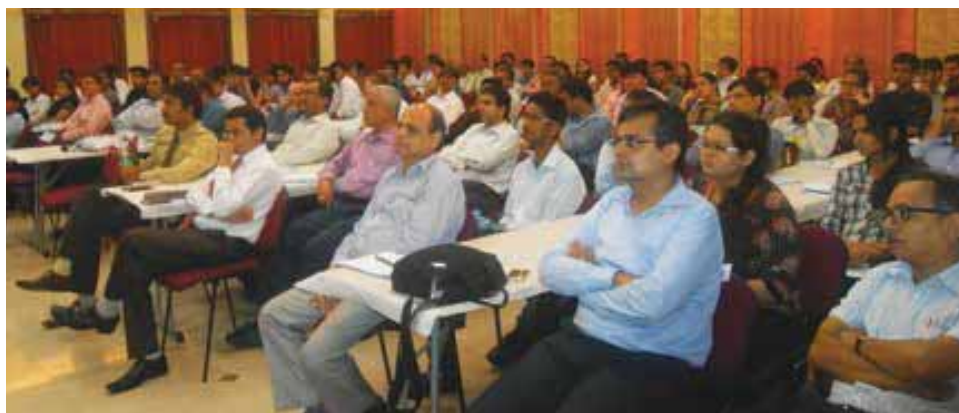
Section of delegates

Workshop on Open Doors to Open Source held on 15th January, 2015 at Babubhai Chinai Committee Room, IMC