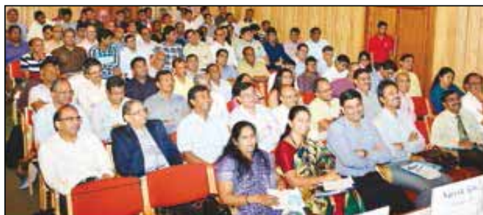
Section of delegates

Seminar on Current Issues in International Taxation jointly with BCAS held on 16th October, 2014 at Senapati Hall, Status Restaurant, Nariman Point, Mumbai – 400 021