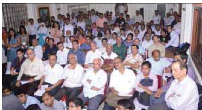
Section of participants