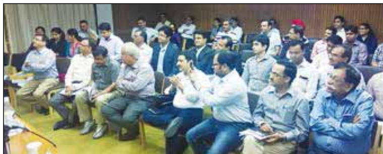
Section of delegates