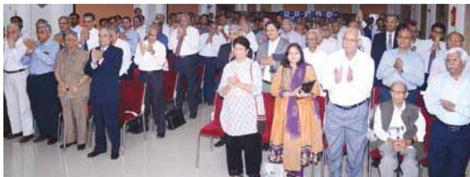
Section of members