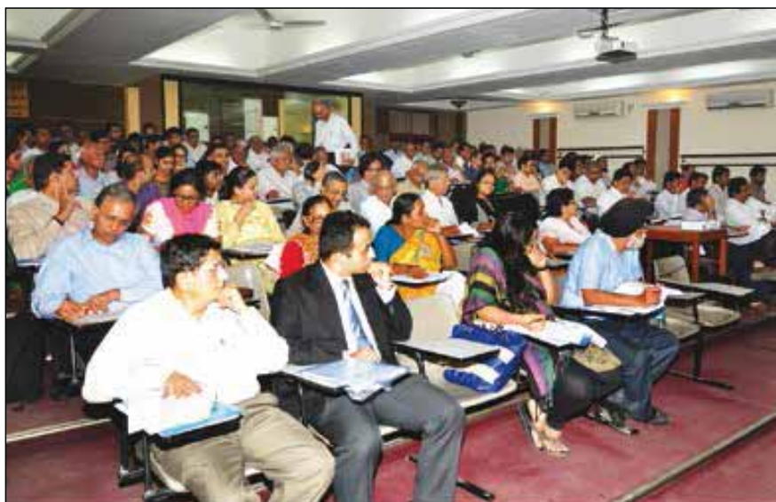
Section of Delegates