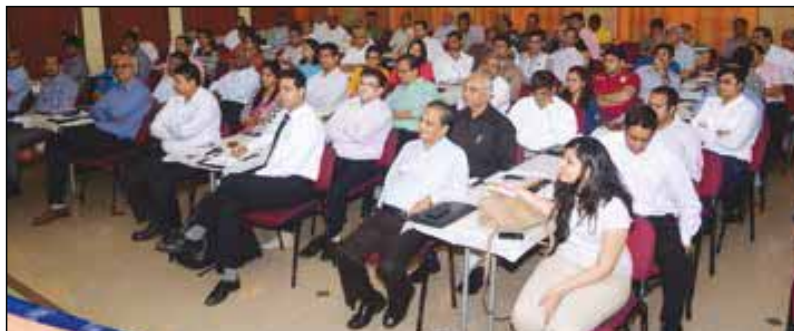
Section of delegates