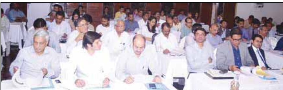
Section of delegates