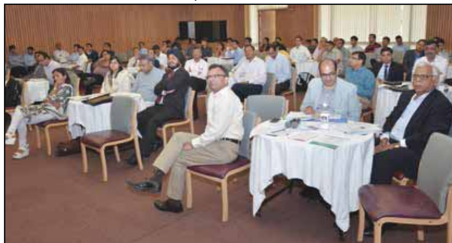
Section of Delegates