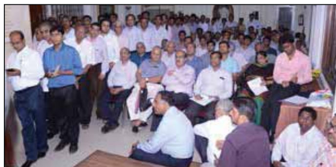
Section of Members