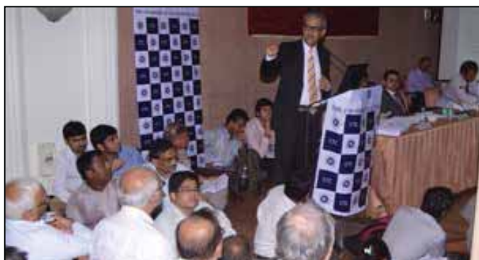
Section of participants