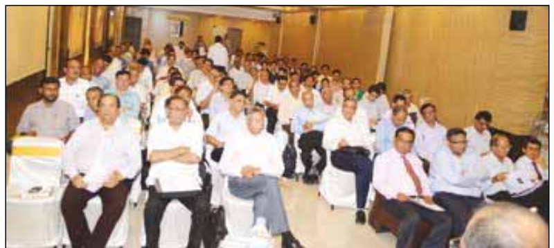
Section of Delegates