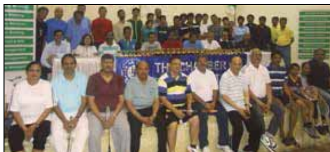
Group Photo – 1st Indoor Sports Tournament