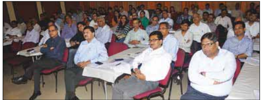
Section of delegates