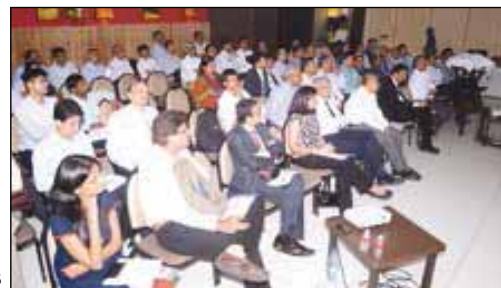
Section of delegates