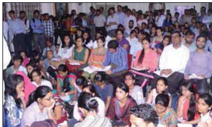
Section of Students

Lecture Meeting on Tax Audit for Students jointly with WICASA and J. B. Nagar CPE Study Circle of WIRC held on 27th August, 2014 at Mayor's Hall, Andheri, Mumbai