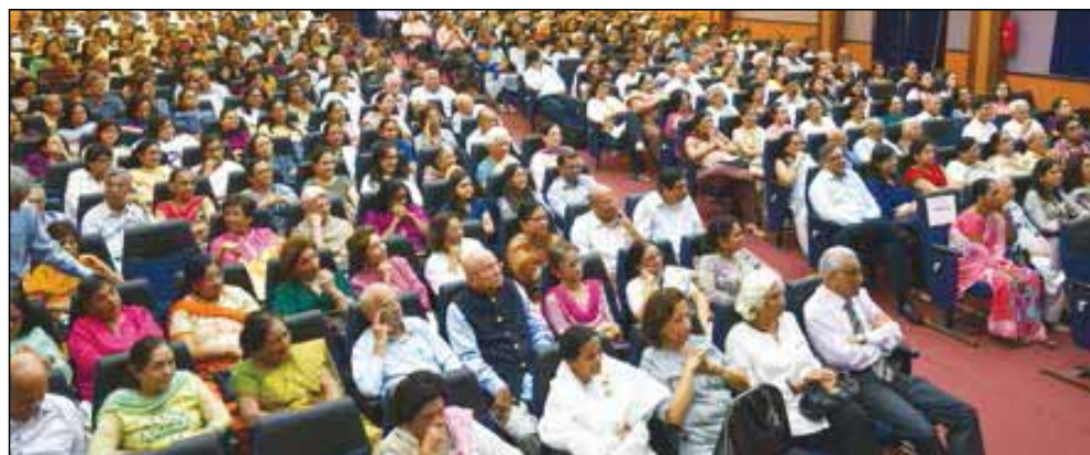
Section of members