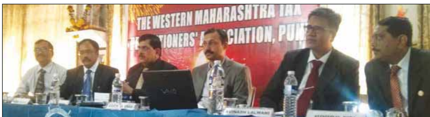
Dignitaries during the Lecture meeting on Union Budget 2015-16

The Union Budget 2015-16 jointly with The Western Maharashtra Tax Practitioners' Association, Pune held on 7th March, 2015 at WMTPA Association Hall, Pune