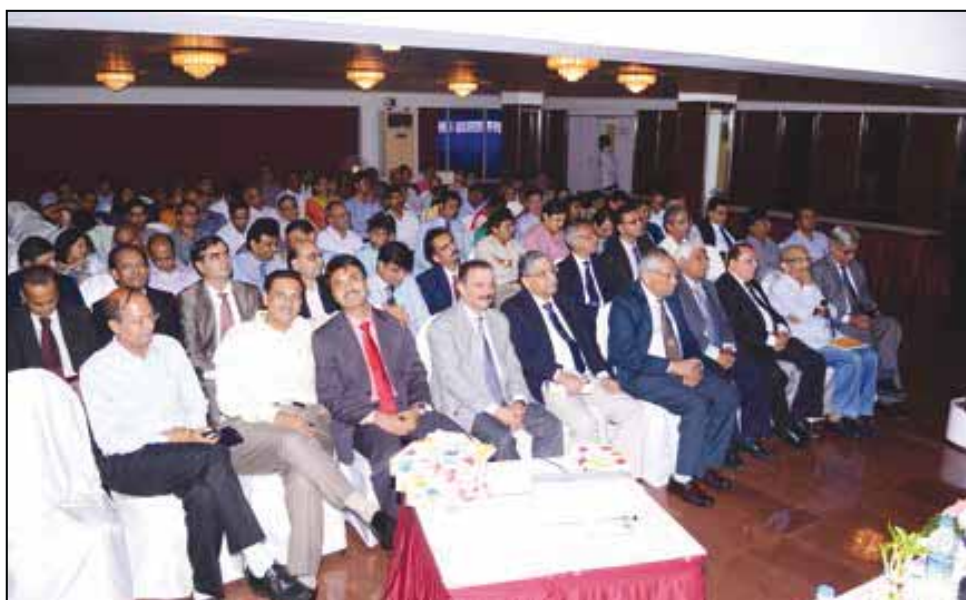
Section of members