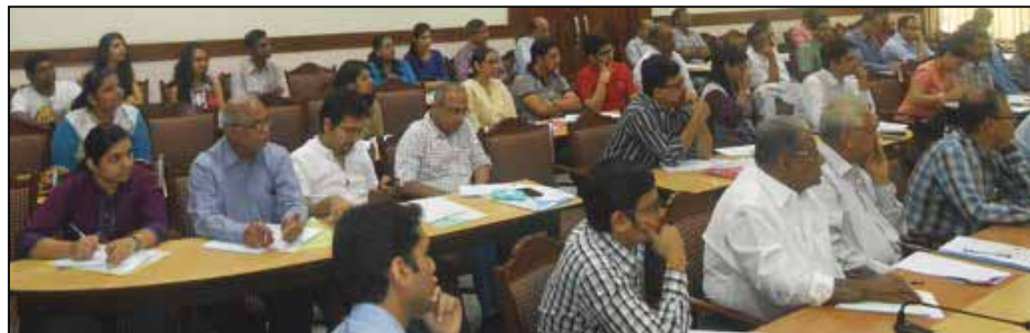
Section of delegates